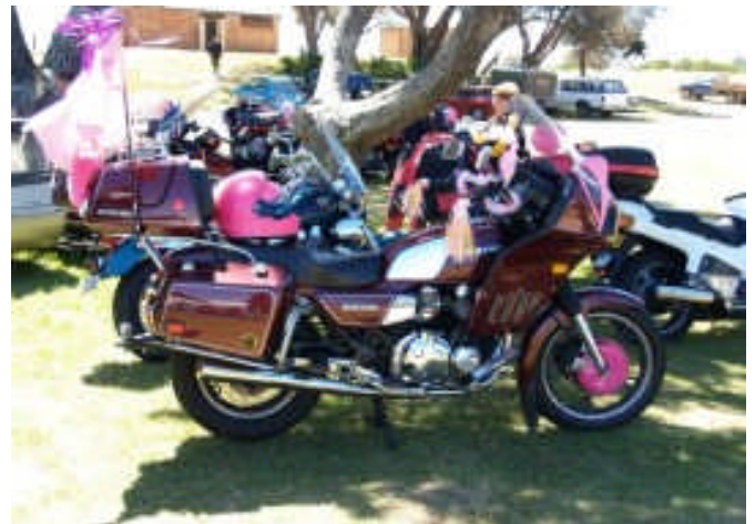
Dan's "The Best Dressed Breast Bike"